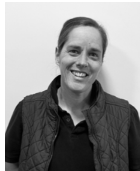
Cori - Butterfly Room